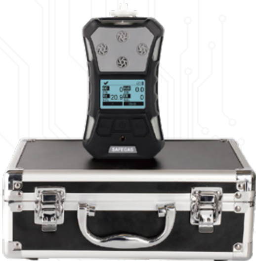
SKY3000 — Portable gas detector

SKY3000 series is a high-performance portable gas detector that can detect multiple gases (Oxygen, combustible gas and toxic gas) at the same time and has man down alarm function. The device has humanized operation functions such as one-key security detection, one-key storage, automatic image flipping, as well as the man down alarm function. It is IECEX, ATEX explosion-proof certified and passed the anti-static test. Its protection level reaches IP67. With safer product design and the module design which makes the detection faster, and the compact ergonomic design makes the device easy carrying. What's more, the device is also a suction and diffusion dual-purpose instrument. The instrument is mainly working in suction mode. When the air pump fails or in special emergency situations, it can automatically switch to the diffusion sampling method, thereby improving the protection.